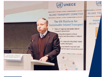
INTERVENTION ON ROAD SAFETY AND FUTURE OF MOBILITY AT THE INLAND TRANSPORT COMMITTEE ORGANIZED BY THE UNECE IN GENEVA