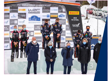
MINUTE OF SILENCE IN TRIBUTE TO HANNU MIKKOLA ON THE PODIUM AT THE ARCTIC RALLY FINLAND IN ROVANIEMI