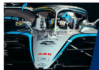
VICTORY OF NYCK DE VRIES ON MERCEDES AND SAM BIRD ON JAGUAR AT THE DIRIYAH E-PRIX, OPENING ROUNDS OF THE FORMULA E SEASON, WHICH BECOMES THIS YEAR AN FIA WORLD CHAMPIONSHIP