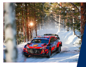
OTT TÄNAK AND MARTIN JÄRVEOJA (HYUNDAI), WINNERS OF THE ARCTIC RALLY FINLAND, 2 ND ROUND OF THE 2021 WORLD RALLY CHAMPIONSHIP