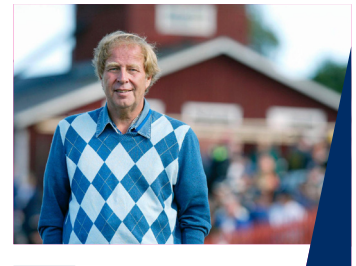
HANNU MIKKOLA, 1983 WORLD RALLY CHAMPION, PASSED AWAY ON FEBRUARY 26TH