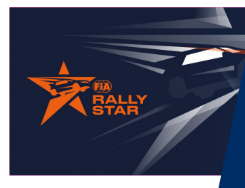
FIA RALLY STAR, A WORLDWIDE PROGRAM FOR THE DETECTION, TRAINING AND DEVELOPMENT OF YOUNG DRIVERS SUPPORTED BY THE FIA INNOVATION FUND (FIF)